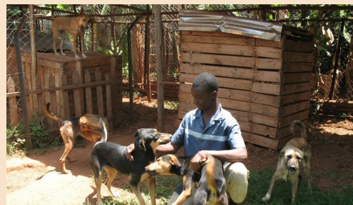
Uganda SPCA caretaker plays with Haven dogs

Back in the 1990s, at our spay/neuter field days in poor communities, we could get over 50 children gathered around to watch the surgery, and some had never met a vet before or knew that anyone could or would perform surgery on dogs and cats. Now, there are many Ugandan children who know about kindness to animals...and many who also proudly proclaim that they want to become veterinarians.