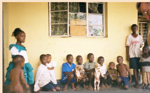
Uganda SPCA's community animal welfare program. Teaching children about kindness to animals.