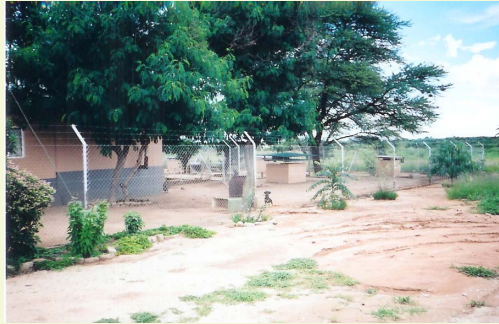
Otjiwarongo SPCA, one of the rural Namibia SPCAs that AKI is supporting.