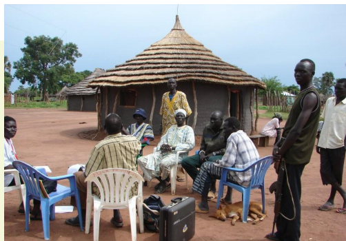
Discussing plans for humane education project in Southern Sudan.