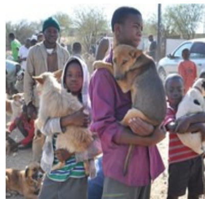
Photo: The Have-A-Heart Spayathon in Katatura, Namibia, the first of its kind in this township outside of Windhoek. The spayathon also included tick dipping, vaccinations, and health assessments.