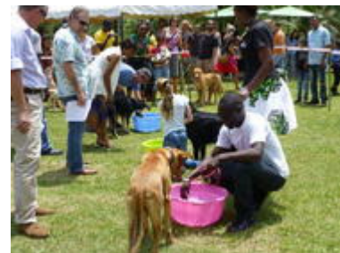
Photo above: Uganda SPCA's Shaggy Dog Show (October 2013). In November's newsletter we'll highlight Uganda SPCA, Bosnia Animal Foundation, Tanzania Animal Welfare Society, Ghana SPCA, and South Sudan humane educators.

At the link below, you can donate directly to AKI, designate an organization (if you'd like) to receive your donation, you can download the AKI brochure to place at locations in your home town, and you can find a variety of other ways to help AKI: