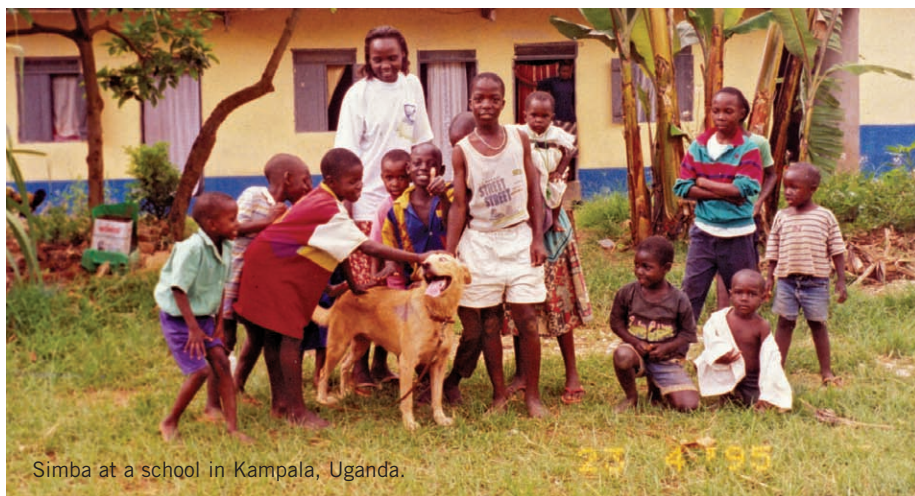
Simba at a school in Kampala, Uganda.

haggling starts, and when it's done, for about $3, the car's occupants drive off with a malnourished puppy. GSPCA worked with the vendors to improve their care of the dogs as well as moderate their rather aggressive marketing methods. They held a course on dog care, and all graduates received a certificate. (The vendors' marketing skills still need a little work, however.)